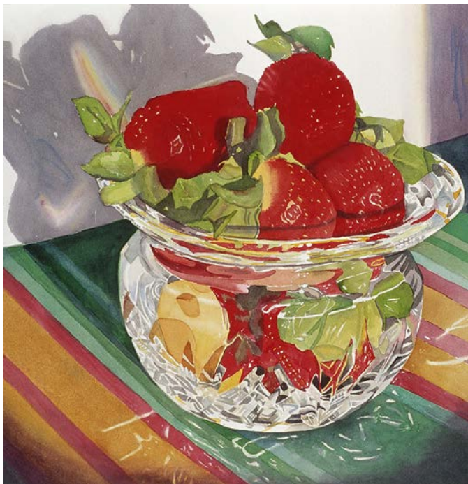
Karen Finerty, "Berries in Crystal"