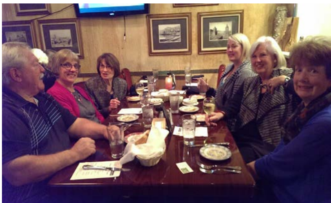
Dining at Carini's