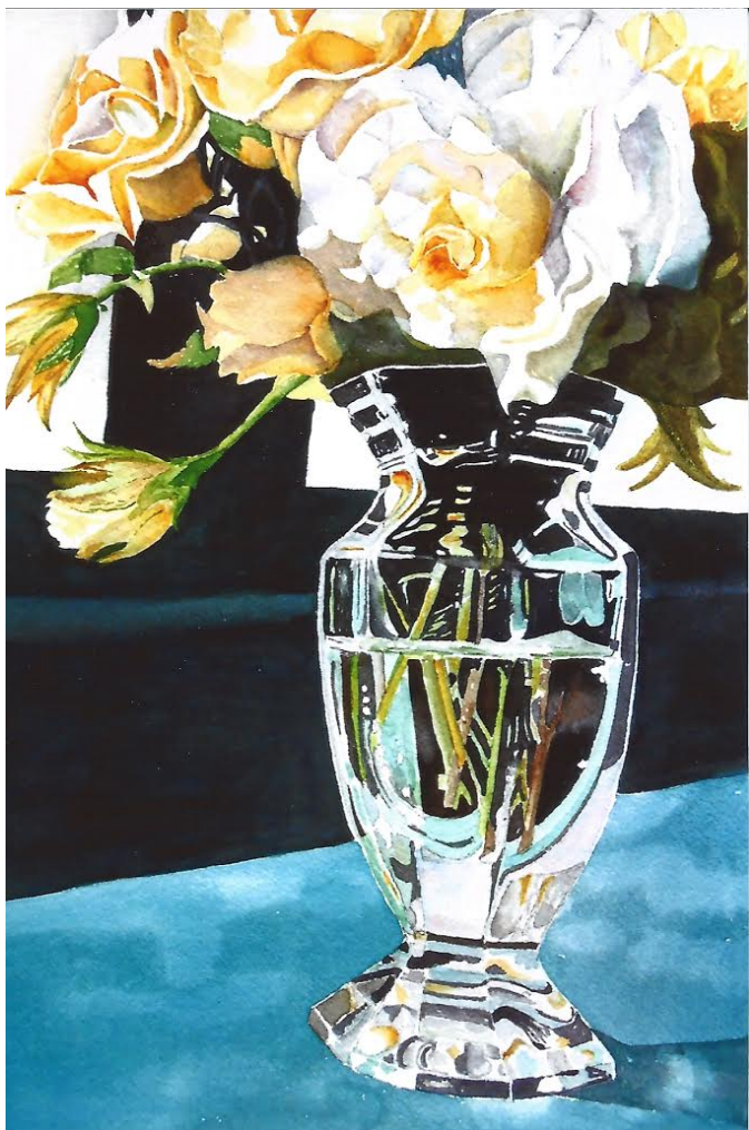
Karen Finerty, "Yellow Roses in Waterford"