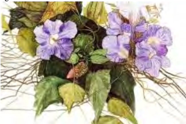
Painting, Clock vine

She was not going to let that stop her from her career objective. Her first job out of college was with Marshall Field's Residential Interior Department. Never mind what she had a degree in, her objective was clear. She stayed with Marshall Field for about 1 year before moving to an architectural firm as their interior designer. In the 1980's she decided to go into her own business as an interior designer. She had the talent to land a wonderful consulting job for a company that was building a headquarters for a company in the United Kingdom. This consultancy opportunity lasted for 4 to 5 years after which she took a full-time job for a Chicago architectural firm until her retirement 16 years ago.