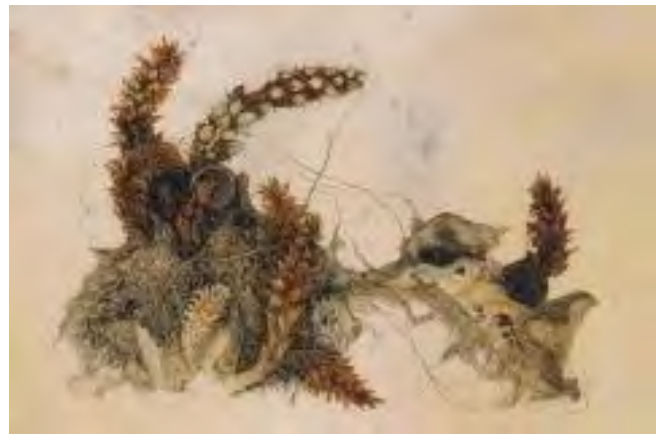
Painting, Squaw root