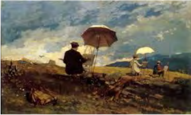
Winslow Homer, Artists Sketching in the White Mountains, 1868

Plein Air painting has become increasingly popular in the art world in the last ten years. I suspect artists of all media have always enjoyed dashing off a visual impression of something on the spot, or spending time with a painting partner or friend at a site that interests them. I loved painting alongside my granddaughter in the Cedarburg Artist's Guild Plein Air Event until she went away to college this past year.