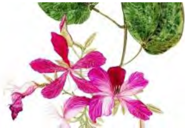
Hong Kong Orchid

I'll quote, in part, in part from her web page to describe her process: