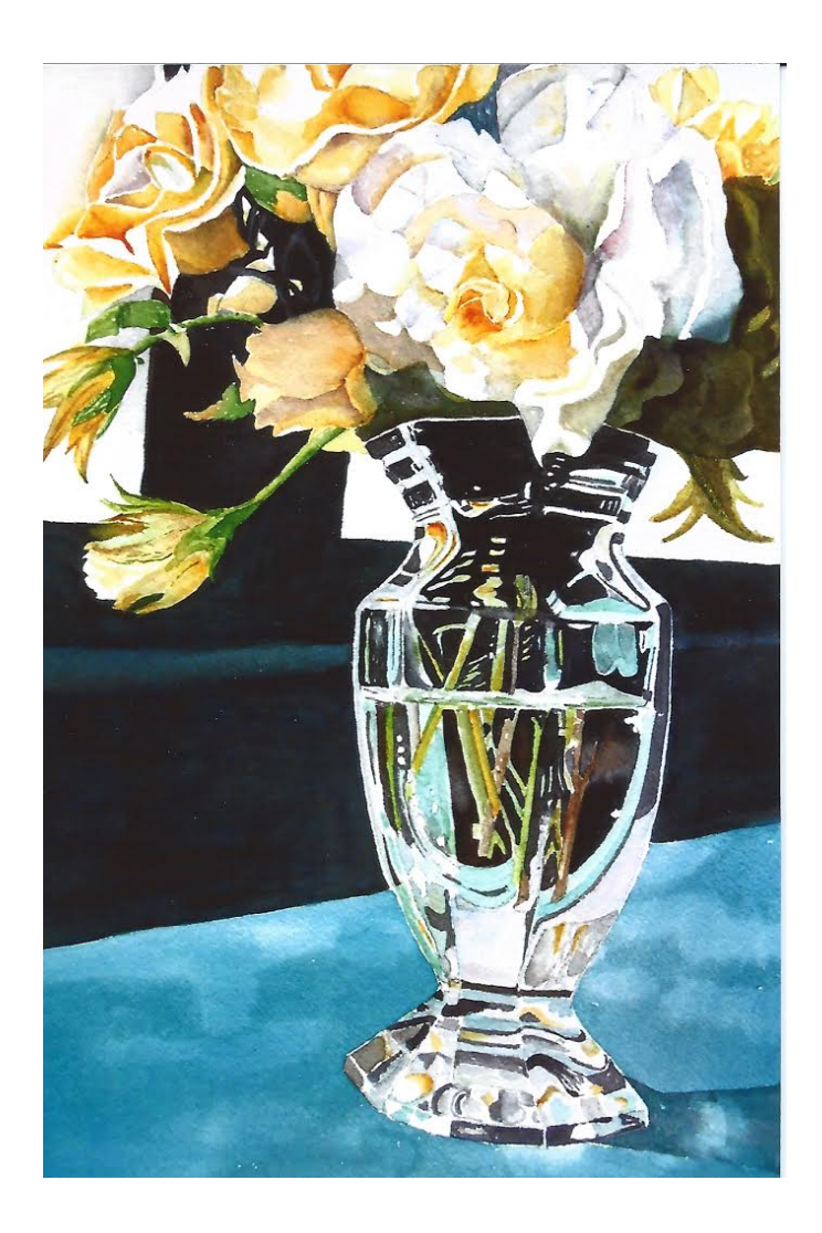
Karen Finerty, "Yellow Roses in Waterford"