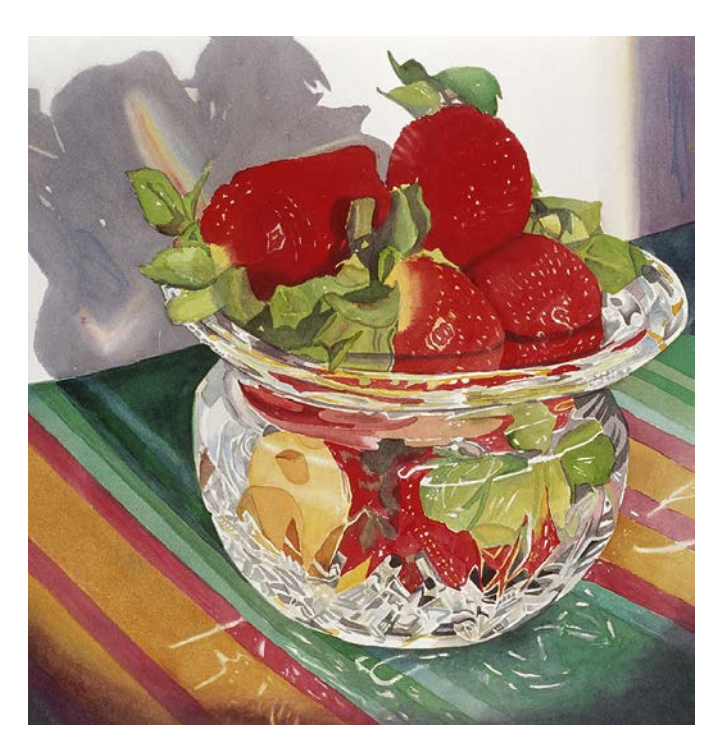
Karen Finerty, "Berries in Crystal"