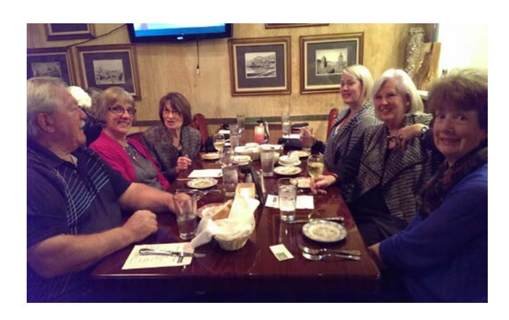
Dining at Carini's