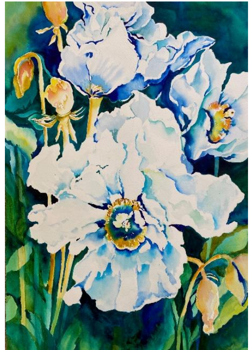
Phyllis Hoopman, Blue Poppies On view in WWS Fall Show

The Annual Members' Dinner, usually held in October, has been POSTPONED due to Covid-19. Our board will be rescheduling two different dinners, one to combine with the spring reception at our Cedarburg Art Museum exhibit and another to combine with a visit to the Transparent Watercolor Society in Kenosha. You will receive separate invitations to these events.